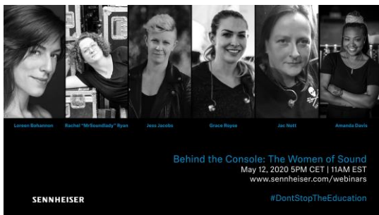
Behind the Console: Women of Sound: Meet six leading women from the pro audio and touring industry

Join leading women from the pro audio and touring industry at Sennheiser’s next round-table discussion on May 13, 1:00 a.m. AEST. #Don’tStopTheEducation